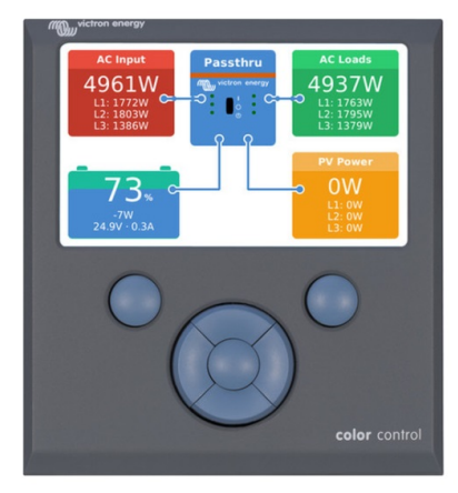
Color Control GX, showing a PV application

When connected to the Ethernet, systems with a Color Control GX or other GX device can be accessed and settings can be changed remotely.